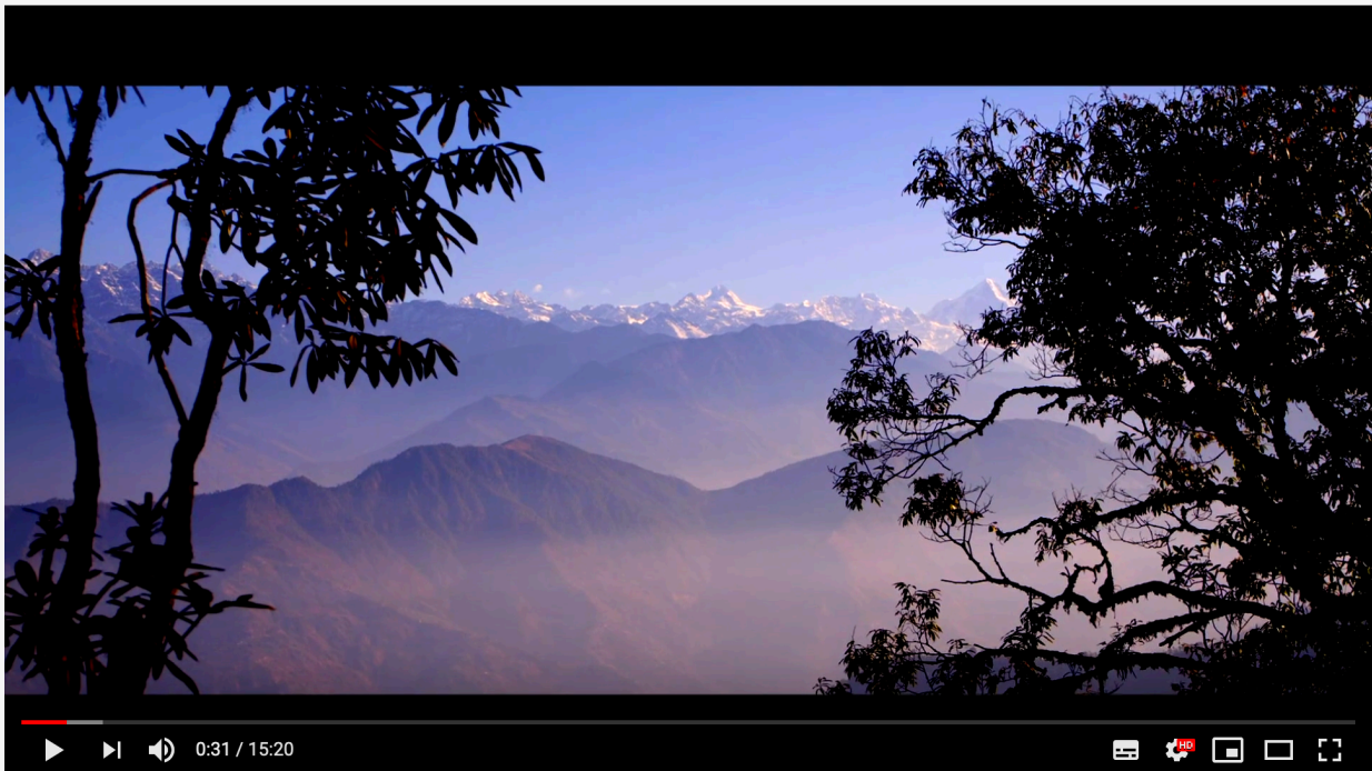
A Plastic Story - PSD Nepal - Full Documentary

The PSD Connect is a quarterly e-newsletter published by the Partnership for Sustainable Development (PSD) Nepal to inform all their partners, previous volunteers, and long-term supporters about our activities and news. PSD Nepal is non-profit social development organization, dedicated to the alleviation of poverty of children and youth of rural Nepal. For more information please visit www.psdnepal.org