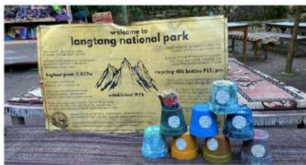
Langtang National Park Rasuwa, Nepal

To subscribe to the PSD Connect, please send an email to info@psdnepal.org with the word “subscribe” in the subject line. If you wish to unsubscribe, please return this note with “unsubscribe” in the subject line.