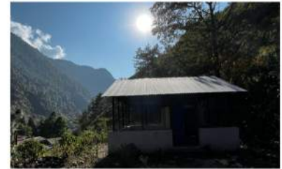
Syabru Bensi CRC (Rasuwa) Community Recycling Centre

Expanding the project's footprint, two additional segregation sites have been established in Mundu and Kyanjin Gumpa. These strategic locations serve as pivotal hubs where waste segregation occurs efficiently, creating a sustainable framework for recycling initiatives within the region. Another significant milestone in the project's expansion is the inauguration of a new Community Recycling Centre (CRC) in Syabru Besi. This centre marks a crucial advancement, now operational and dedicated to the recycling of PET plastics, glass, and tin. The establishment of this CRC represents a pivotal step towards addressing the environmental impact of non-biodegradable materials within the community.