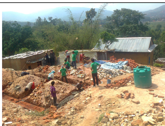
Pre-Phase I: Figure 1. Recent trench excavations.