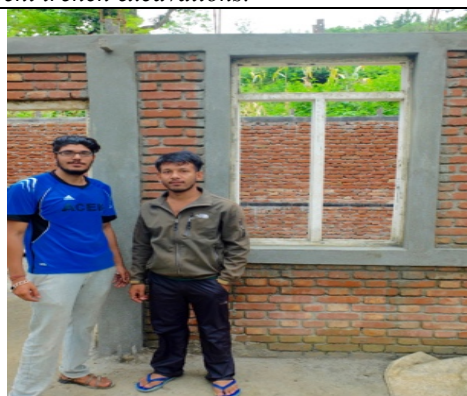
Phase II – Figure 3. Construction of initial brick layer to sill level and then second brick layer to lintel level