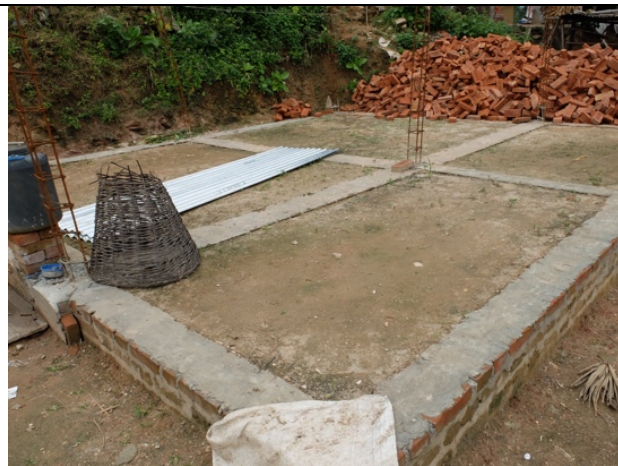
Pre-Phase I: Figure 1. Recent trench excavations.