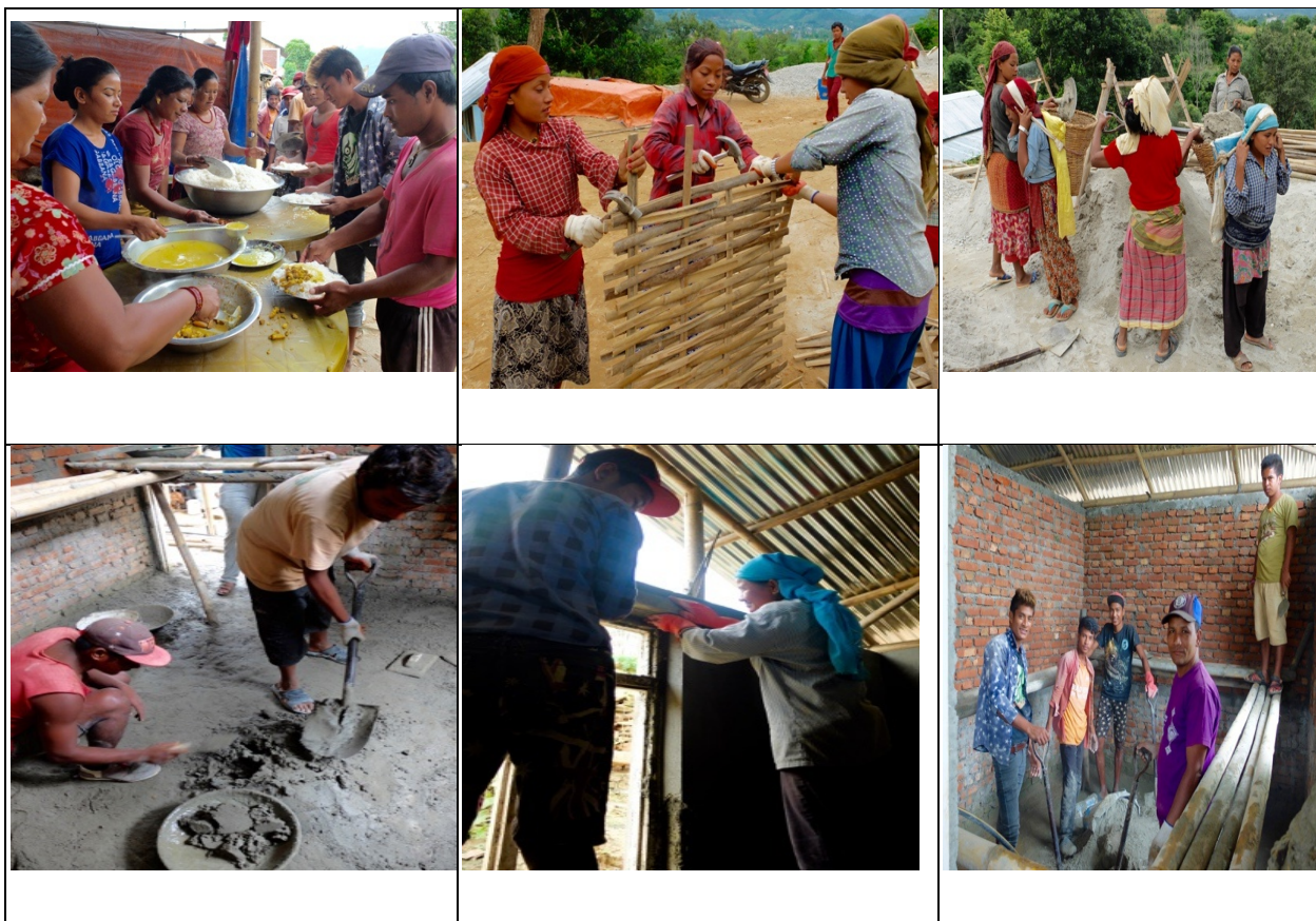
Figure 6. Workers receiving their one meal of the day and working on various aspects of the construction process.