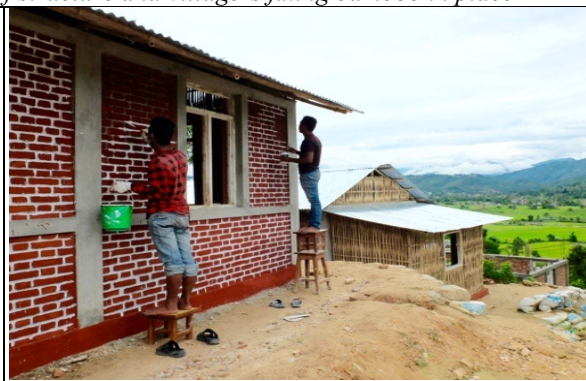
Figure 7. New homeowner painting their new house ahead of Dashain festival.